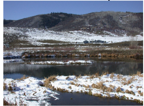
Chuck Lewis State Wildlife Area