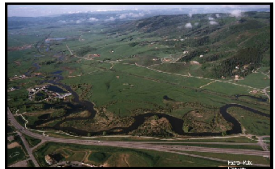
Williams Preserve & Rotary Park

Williams Preserve 93 Acres - Rotary Park 29 Acres