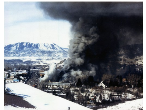
Downtown Steamboat Fire Mid 1990's