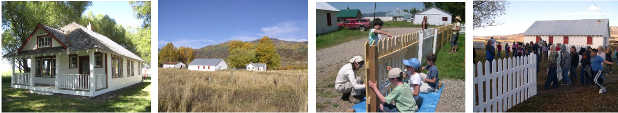
Main House, c. 1917; Bunk house, not shown, c. 1929; Coal Shed, c. 1920s; Barn, c. 1960; Pole/Stock Shed, c. 1945