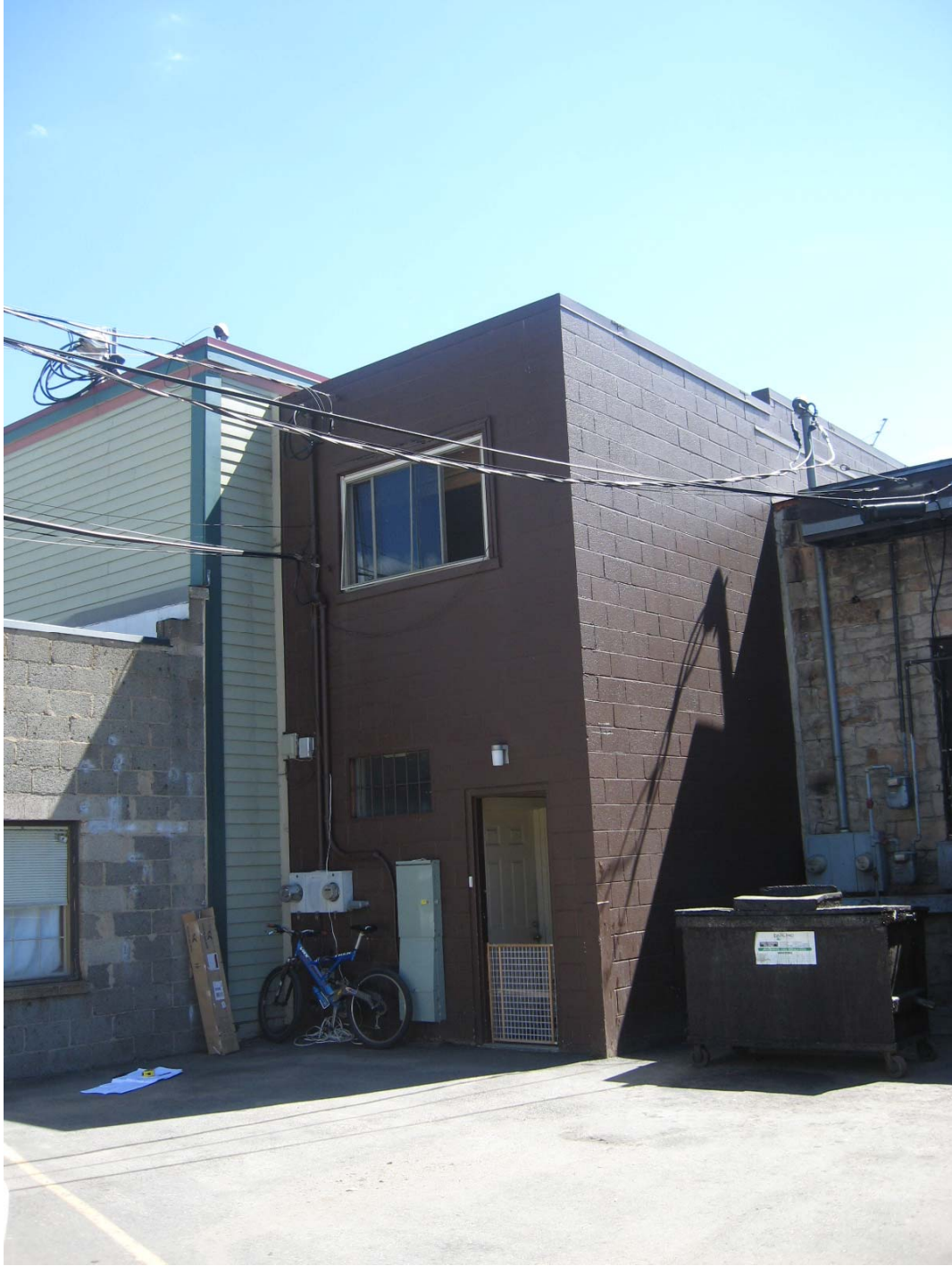
2. Rear Elevation, looking southwest