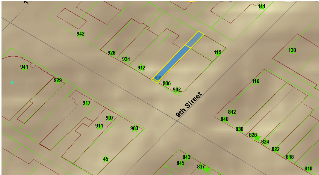
908 Lincoln Avenue

Staff finds that the Model Shoe Shop located at 908 Lincoln Avenue is eligible to the City’s Historic Register as an Historic Resource. The resource is significant under Criterion 1 in the area of Commerce as an example of the twentieth century commercial development of Steamboat Springs. Staff recommends that the Historic Preservation Commission approve listing of the Model Shoe Shop as an Historic Resource.