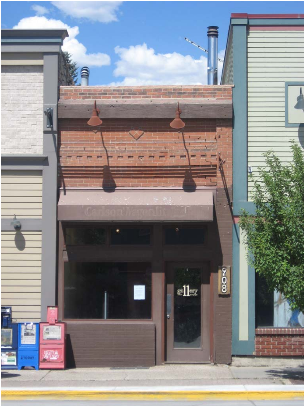
1. Front Façade, looking northeast